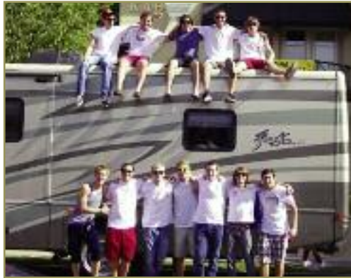
Brothers took a trip to Cal to kick off the spring semester.

Our intramural teams have kept up to pace with the rest of our outstanding achievements. Brothers are competing in flag football and basketball and have participated in tournaments for racquetball and tennis. We look forward to finishing the intramural soccer season and hope to compete for the championship.