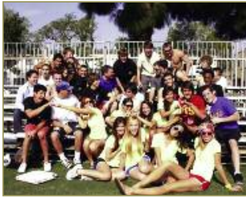
Epsilon Omicron paired with Tri Delta for the Kick It for Cancer event. There was a great turnout and a good time was had by all for a great cause.

We remain focused on efforts to keep our alumni involved in the Chapter and have hosted many football tailgates at Alumni Park, attended events at the beach, and invited alumni to join us for the annual Plaque Banquet in April. Our families were also on hand to honor the new executive council and fall pledge class at the Candlelight Dinner in December. We enjoy the wisdom, camaraderie, and fellowship that our alumni and families offer during these events and throughout the year.